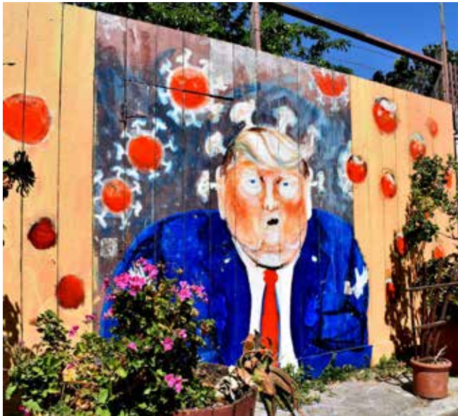
2. Balmy Alley had a Donald Trump virus wall and Lilac Alley a woman wearing a face mask.