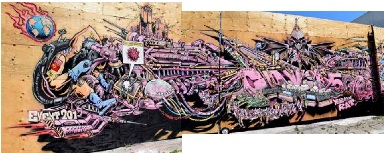
3. Graff artists had been out with many new walls in Erie, the one being shown particularly intricate.