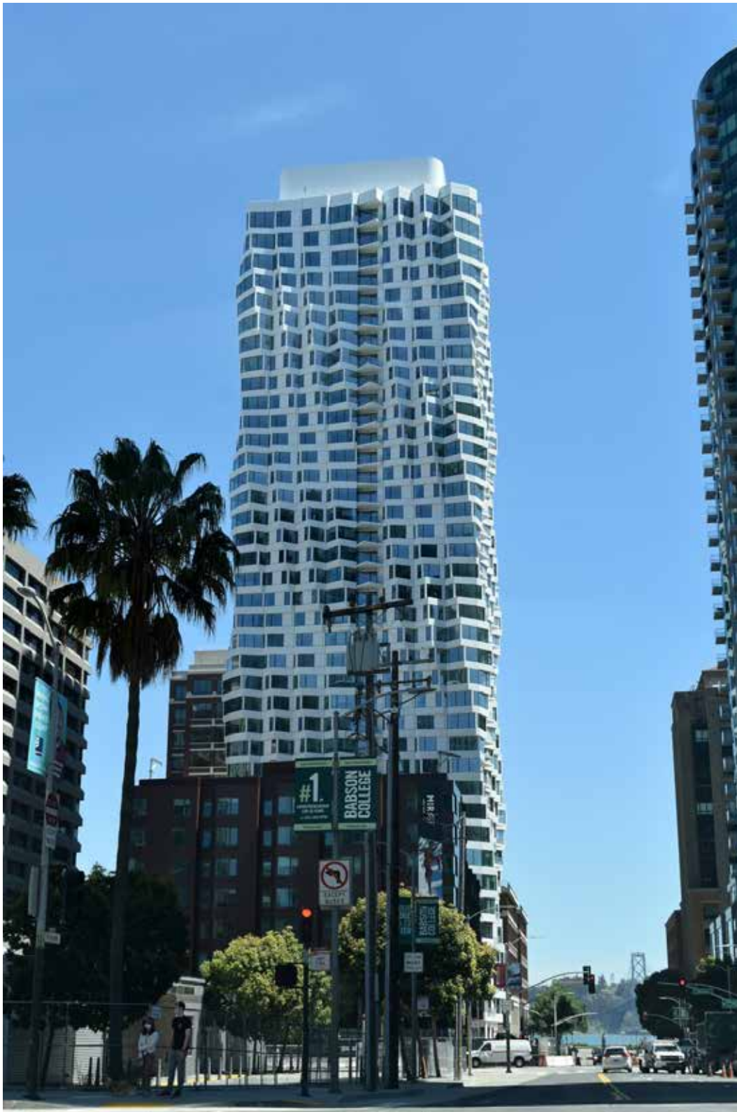
5. The contrast of “those who live above it all” is quite clear in this newly built high-rise apartment building.