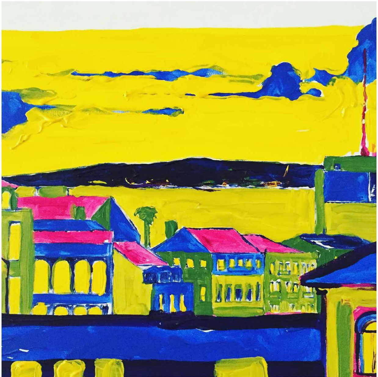
Figure 5: View 1 detail