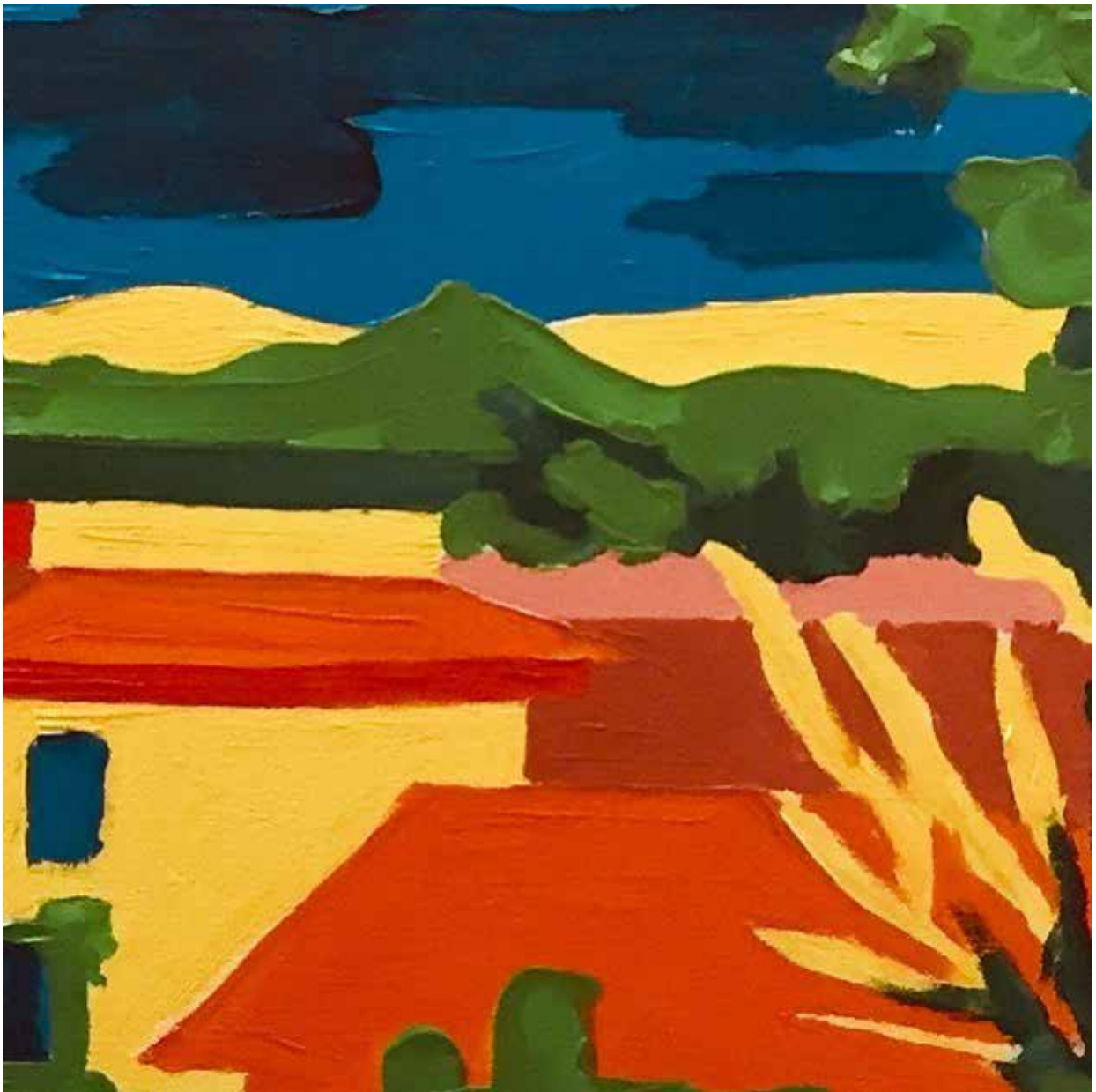
Figure 4: Fauvism (reference)