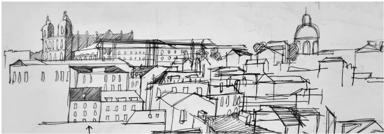
Figure 1: Lisbon, Alfama