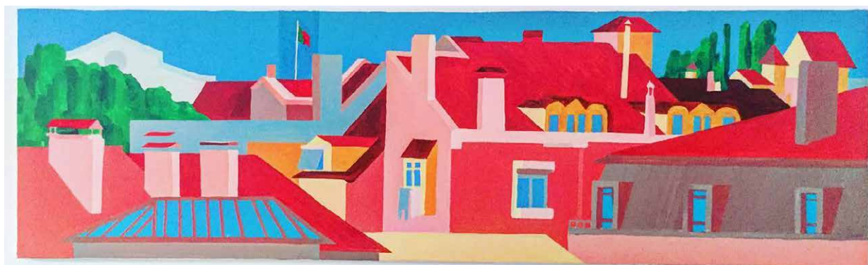
Figure 3: View 2 (sketch, process, full painting)